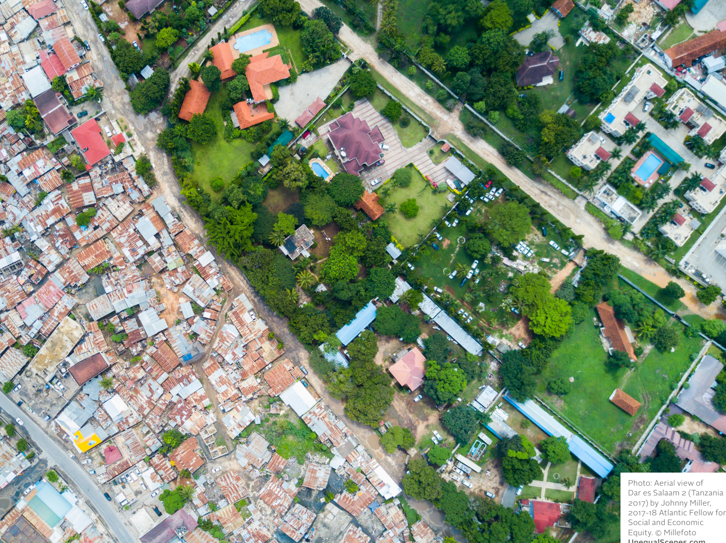
Photo: Aerial view of Dar es Salaam 2 (Tanzania 2017) by Johnny Miller, 2017-18 Atlantic Fellow for Social and Economic Equity. © Millefoto UnequalScenes.com