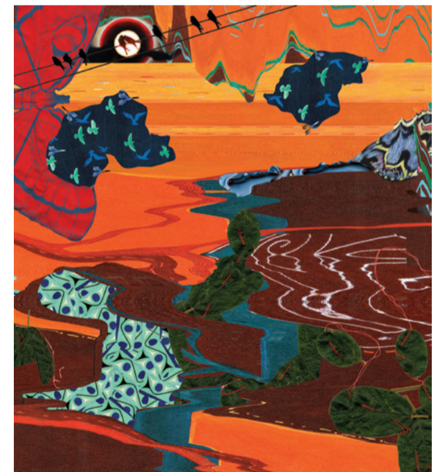
New Horizons Within Halina Rauber-Baio aka Juno Algaravia

“GDP doesn't include the social production of women. It wasn't meant to serve marginalized groups. It was only meant to serve colonial masters, particularly in Africa.”