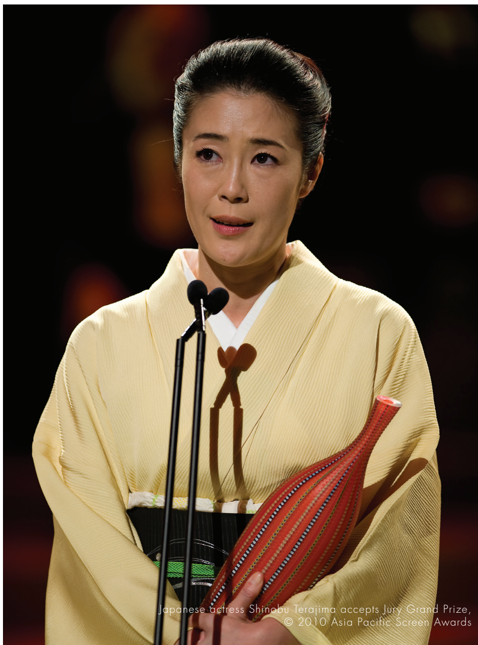
Japanese actress Shinobu Terajima accepts Jury Grand Prize

Equally important to presenting challenging issues and perspectives is capturing the creative spirit of resistance and disruption by women and communities and reinstating women in the central frame of history: