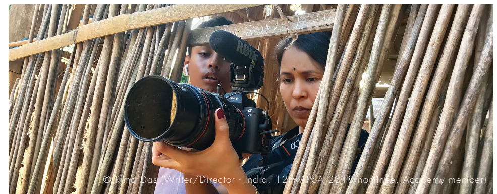
© Rima Das / Writer / Director - India, 12th APSA 2018 nominee, Academy member

A separate study of the American industry found that in both 2013 and 2014, women comprised only 1.9 percent of the directors for the 100 top-grossing films . Excluding their art-house divisions, in 2017 the six major studios released only three movies with a female director. It is hard to believe the number could drop to zero, but the statistics suggest female directors are slipping backward . Extrapolating from the data gathered by Martha Lauzen of San Diego State University, journalist Maureen Dowd (2015) says that 'in 2014, 95 percent of cinematographers, 89 percent of screenwriters, 82 percent of editors, 81 percent of executive producers and 77 percent of producers were men' .