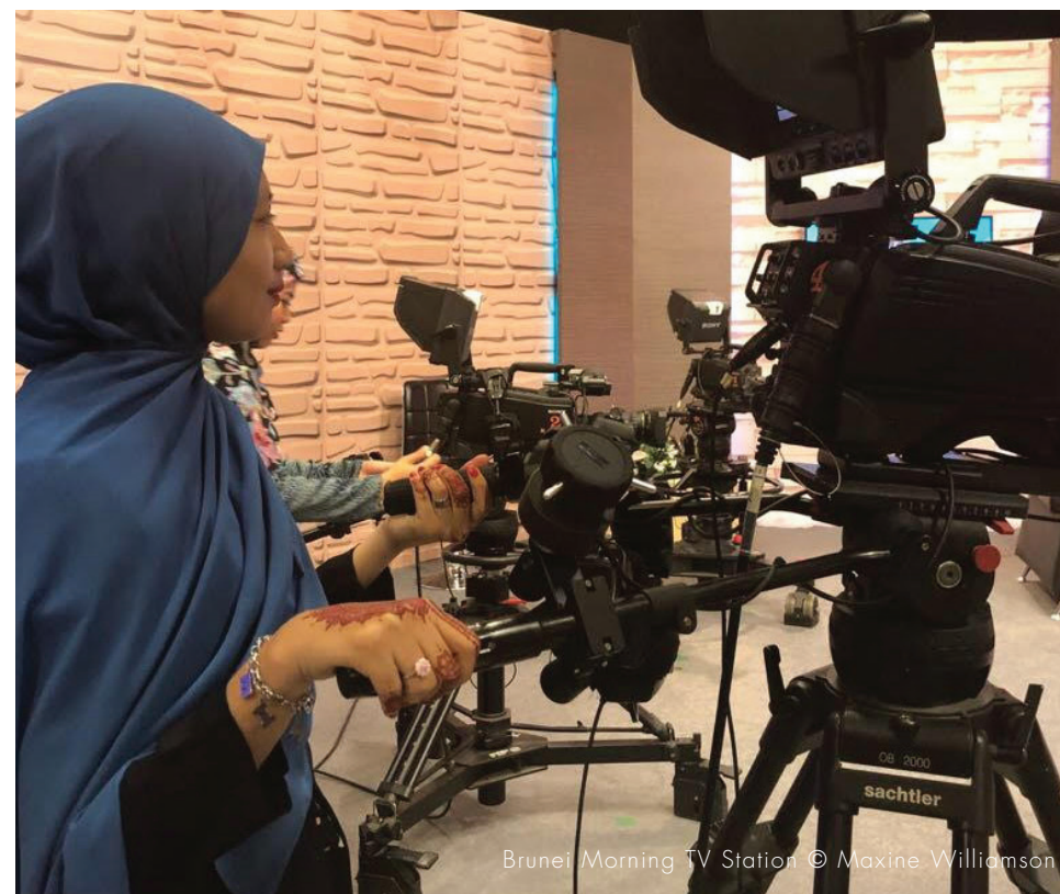
Brunei Morning TV Station

So, no, definitely. They drive off the cliff. And I found sometimes men can't understand what that's about. But it's really a metaphor for retaining control of their fate, being in charge of themselves, which they refuse to give up. So, could they retain control of themselves and surrender today? No'. (Lederman 2018)